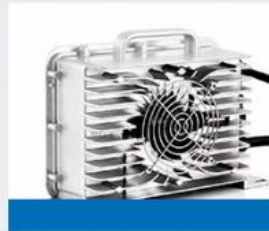
Lithium battery charger, waterproof IP65