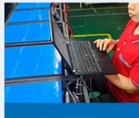
Professional debugging software