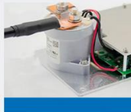
High Precision BMS