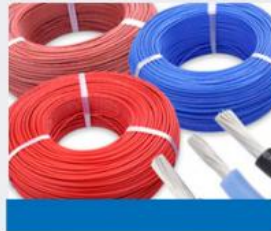
Pure copper flame retardant wire