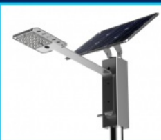
Solar Street Lighth