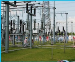
Power Station energy storage