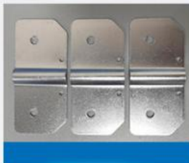
Low resistance connecting piece