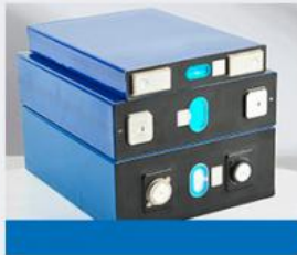
Automotive Grade Cells